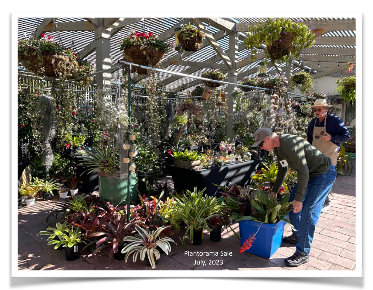
INTERESTED IN SELLING YOUR BROMELIADS AT SHERMAN GARDENS?

Our Club Board would like to remind all sellers that all plants are exceedingly clean and disease free to reflect the high quality of our Show Plants on display. Each plant should have two tags if the seller wishes to receive 75% of the sales price. One tag will be cut off by the cashiers in order to record its sale. Do not use wooden sticks which are so firmly affixed that it is very difficult to remove them. Tag the plants securely to prevent "tag switching" before the customer pays for them. Identify the plant name, write your initials, and write the price in whole dollars. All writing must be legible. You may drop off plants on Friday during setup. Or, you may arrive as early as 9:00 a.m. on Saturday and have your plants completely ready by 10:00 a.m. (show and sale open at 10:30 a.m.)